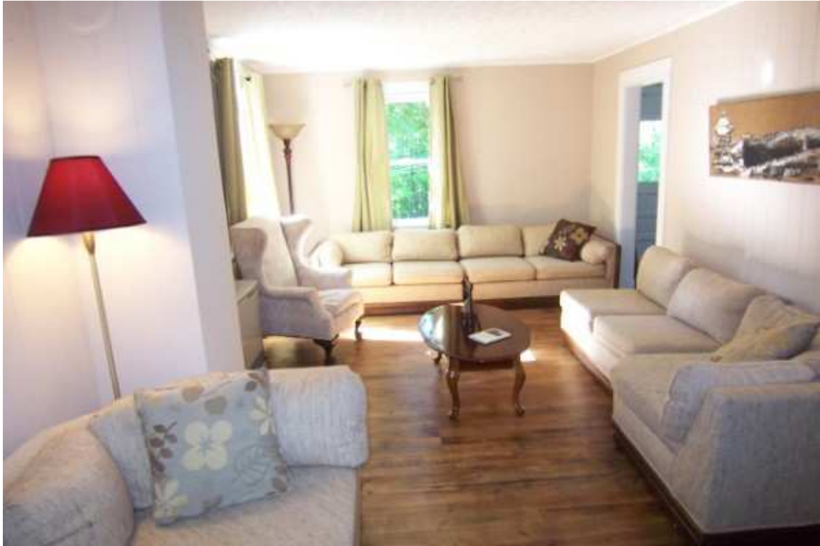
Great Room in Morning Light – Furnishings from Windsong

The house, recently renovated with all rooms freshly painted, is fully furnished for turnkey rental. The former owners of Lake Minnewaska have supplied the cottage with many antique furnishings from the former Lake Minnewaska hotels – Cliff House and Wildmere. The Master Bedroom has a queen bed. A bunk bed and two twin beds are in the second and third bedrooms. All mattresses and pillows are new. Linens for beds and bath supplied. The cottage is ready to enjoy – just bring your personal effects, relax and enjoy the summer and fall in the Shawangunk Mountains, only 90 miles from New York City.