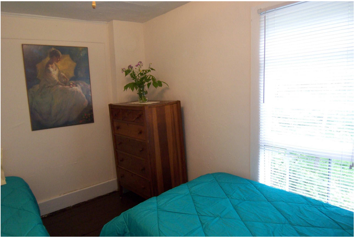
Twin Bedroom – Window view