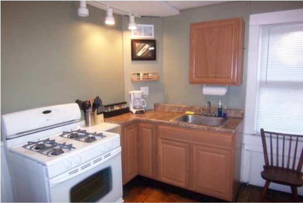
Country Kitchen with gas stove