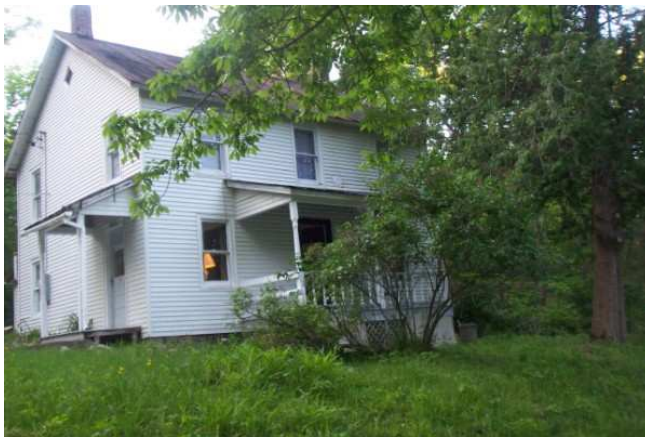
School Master House

This private residence is located only 1,000 feet from the Lake Minnewaska State Preserve's Peterskill Office, 200 paces from The Minnewaska/Mohonk Carriage Way and one road mile from the State Preserve's Main Entrance. The recently renovated