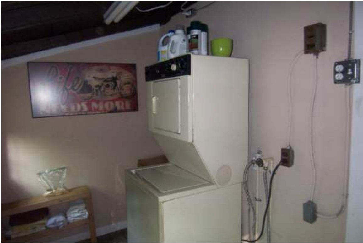
Laundry & Storage Area