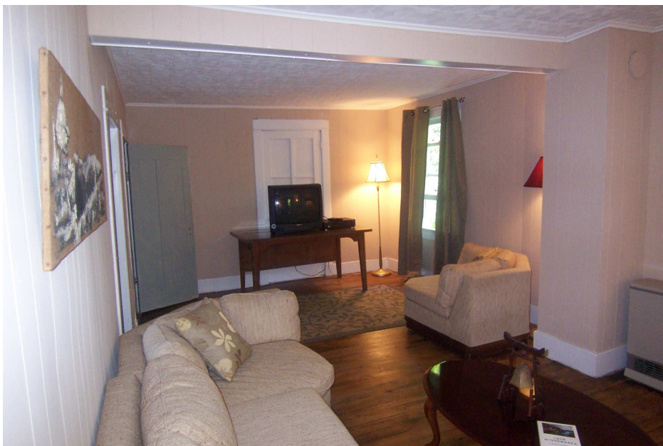
Great Room – TV/games area with reading nook