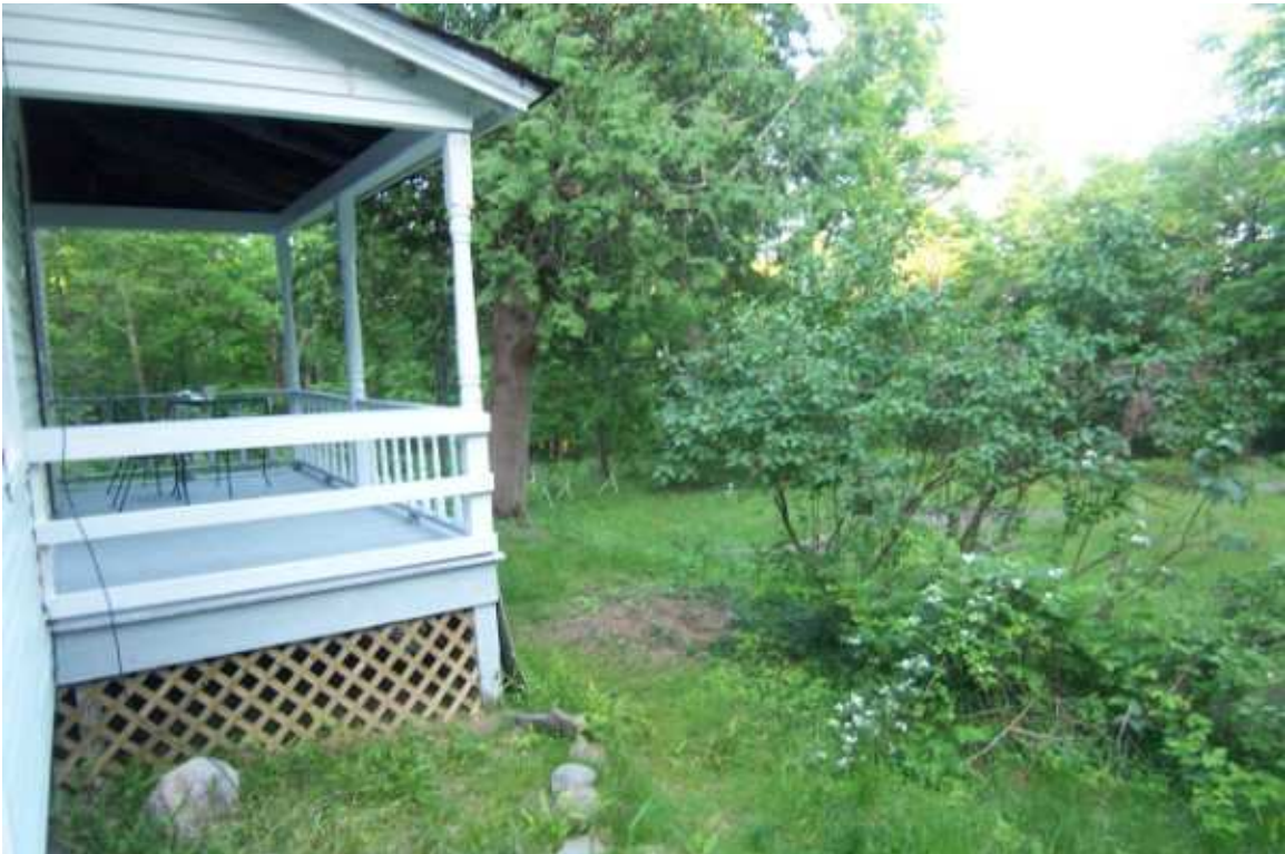
Veranda view to front lawn with lilac and raspberry bushes

The Shawangunk Mountains are one and one-half hour's drive from Manhattan, five hours from Boston or six hours from D.C.