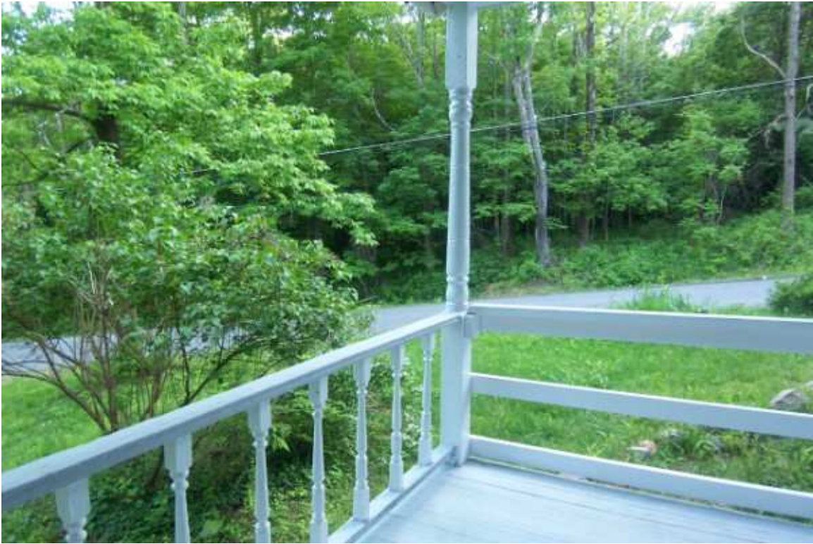
Veranda View to Mohonk Trust Preserve