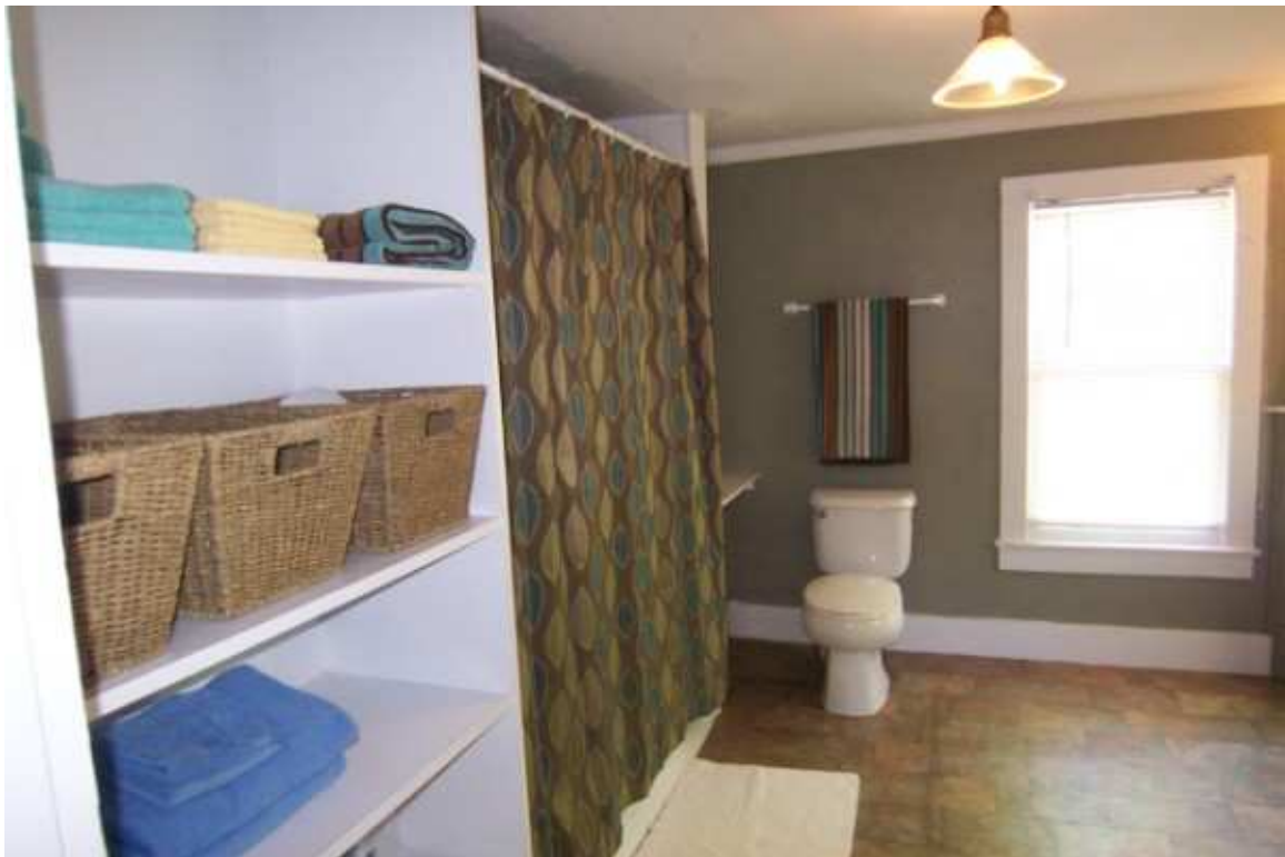
Spacious Bathroom with Storage Shelves