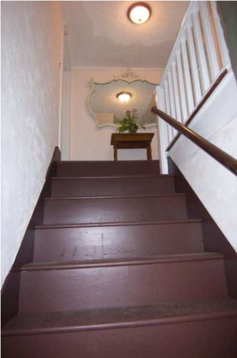
Stairway featuring Mirror from Wildmere Dining Room & 1879 Cliff House Writing Table