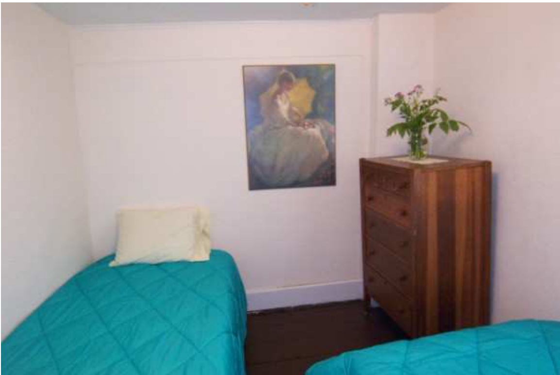
Twin Bedroom with 1912 North End Wildmere Mission Style Oak Chest