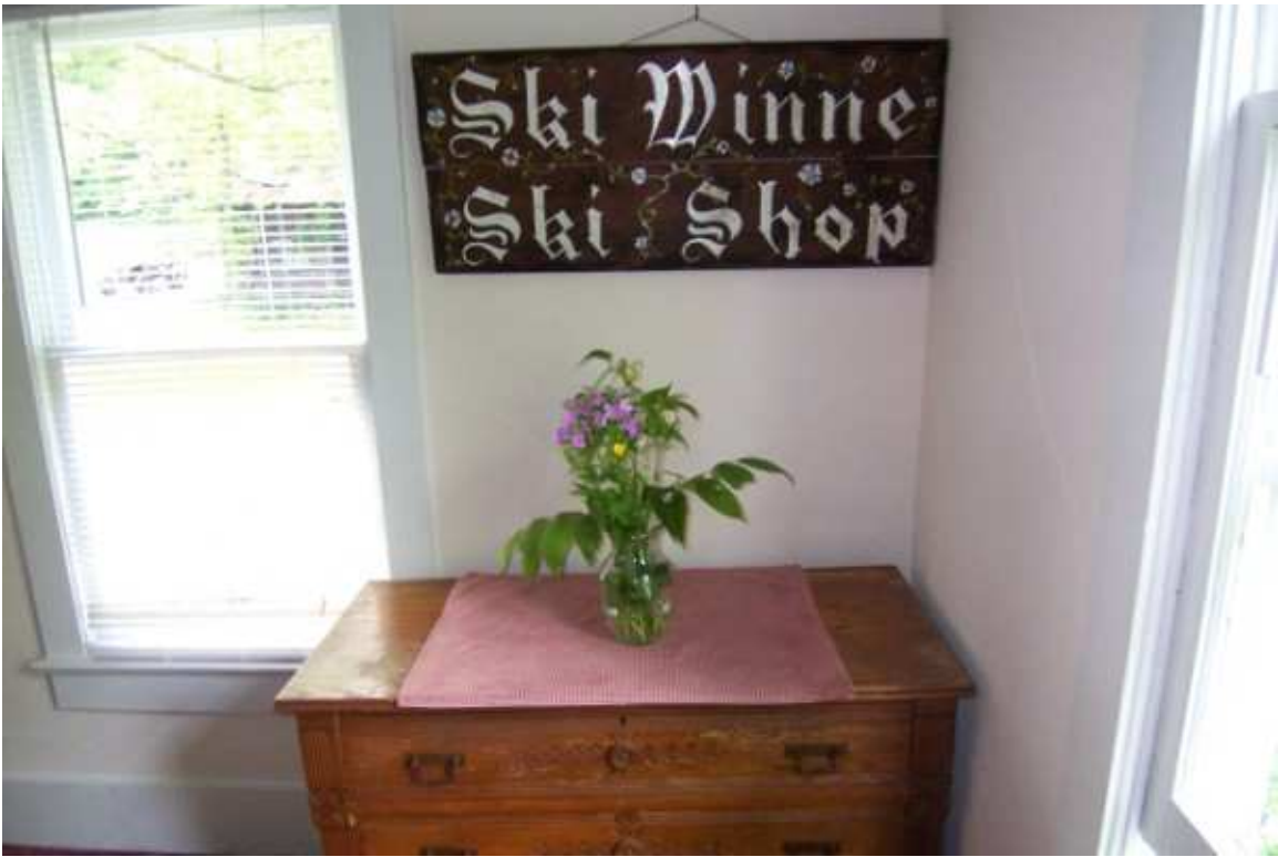
Bunk Room with 1879 Carved Chestnut Wildmere Dresser Base & original hand painted Ski Minne sign.