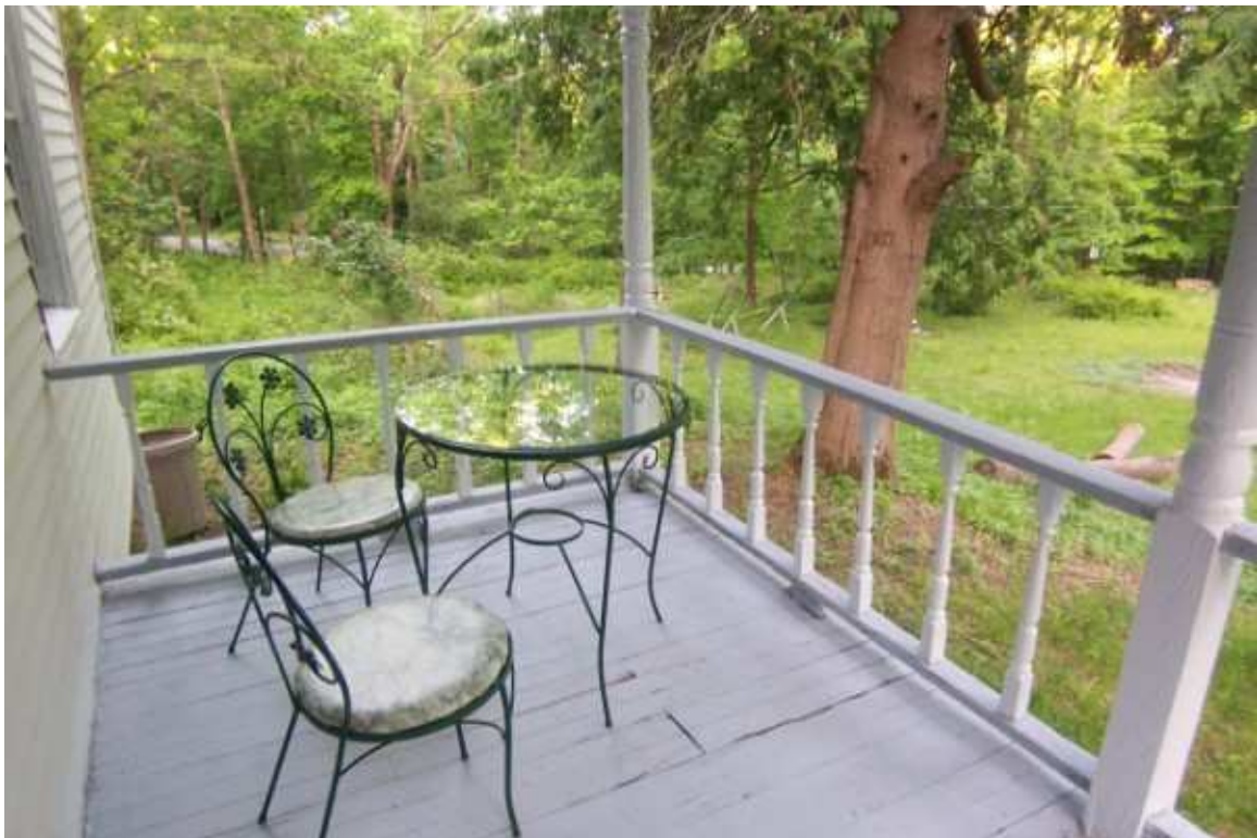
Veranda Seating with Wrought Iron Table & Chairs from Windsong