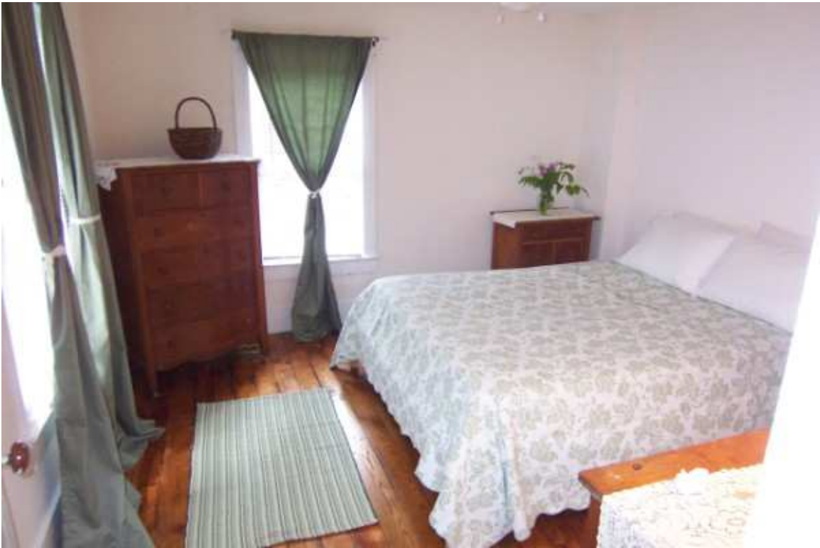
Master Bedroom with Queen Platform Bed. Scallop Edge Chest of Drawers and Wash Stand from 1912 Wildmere Hotel North End.