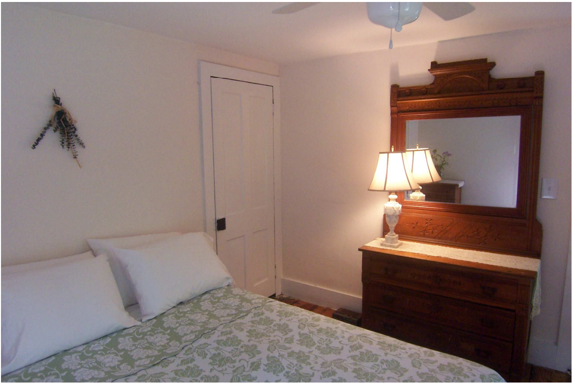
Master Bedroom with 1889 Carved Chestnut Dresser from the Wildmere House. Marble lamp from Windsong.